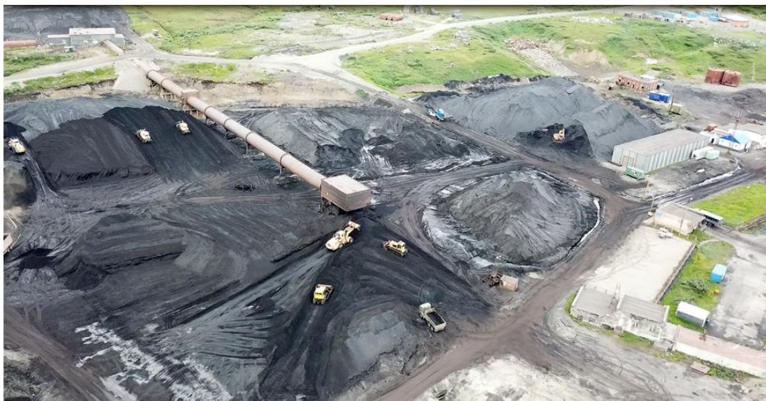
Beringovksy Port coal stockpiles: Summer 2018

Our coal products have been well received with coal quality testing of shipments achieving and exceeding client expectations. After a slow start influenced by unexpectedly adverse weather conditions in June, coal loaded to 31 August is 239kt. The results for the first half of the shipping season places us well to realise our sales tonnage targets, given the port stockpiles of 232.1kt in addition to expected September and October production of between 120kt to 140kt. We currently expect to end the season in line within the previous sales guidance range of between 440 and 495kt.