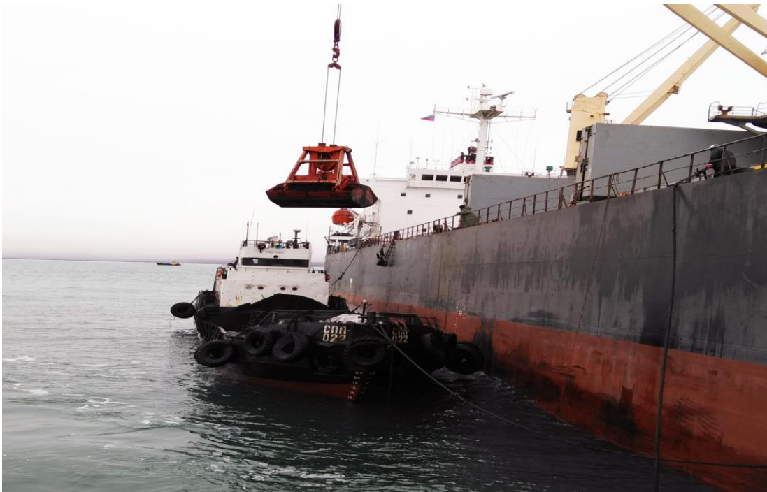
Beringovsky Port vessel loading operations: summer 2018