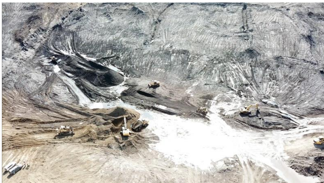
TIG Project F Pit operations summer 2018

Production for the July-August period has been positively influenced by taking delivery of two additional Scania haulage trucks, an excavator and bulldozer at the end of June and TIG has taken delivery of a further two Scania haulage trucks at the Beringovsky Port on 4 September, which are expected to further enhance haulage capacity.